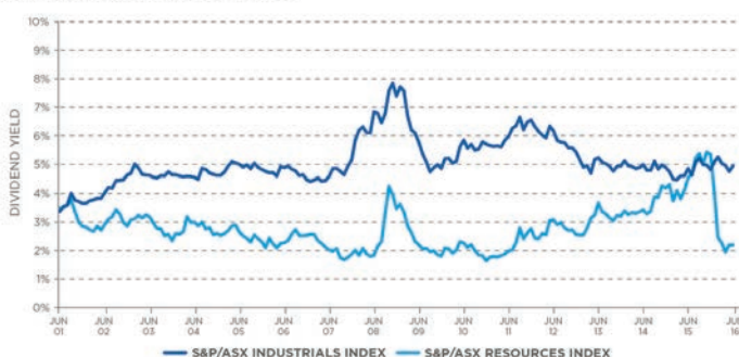
CHART 1: HISTORICALLY INDUSTRIAL SHARES HAVE PAID STRONG DIVIDENDS Historical dividend yields, June 2001 – June 2016

Resource companies typically have very high capital expenses, such as equipment and machinery, and their profitability relies heavily upon the changing market price of the commodities they sell or use. As a result they are required to retain a large portion of earnings to provide a cushion against volatile market conditions. This naturally means they have less cash to pay out to shareholders.