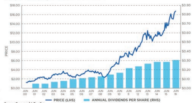
CHART 2: ARB CORPORATION HAS PROVIDED STRONG EARNINGS AND DIVIDENDS GROWTH Share price vs dividends per share, June 2000 – June 2016

ARB Corporation is Australia’s largest manufacturer and distributor of 4x4 accessories. Having grown from a family garage in Melbourne, the company now has a large international presence and distributes its products to more than 100 countries around the globe. Management’s unwavering focus on quality, product innovation and cost control has allowed the business to continually expand at a steady pace over time, maintaining consistently strong profit margins, earnings and cash flow.