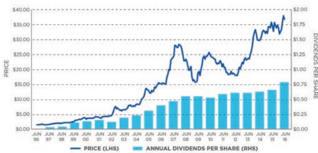
CHART 3: REECE INVESTORS HAVE ENJOYED SHARE PRICE RISE OVER THE LONG TERM Share price vs dividends per share, June 1996 to June 2016

Supported by a strong brand name and a reputation for quality, Reece have built a dominant position in their market. As evidence of this, Reece has delivered earnings growth of 15 per cent per annum since 1996. This earnings growth is reflected in the long-term rise in its share price, as reflected in the chart below.